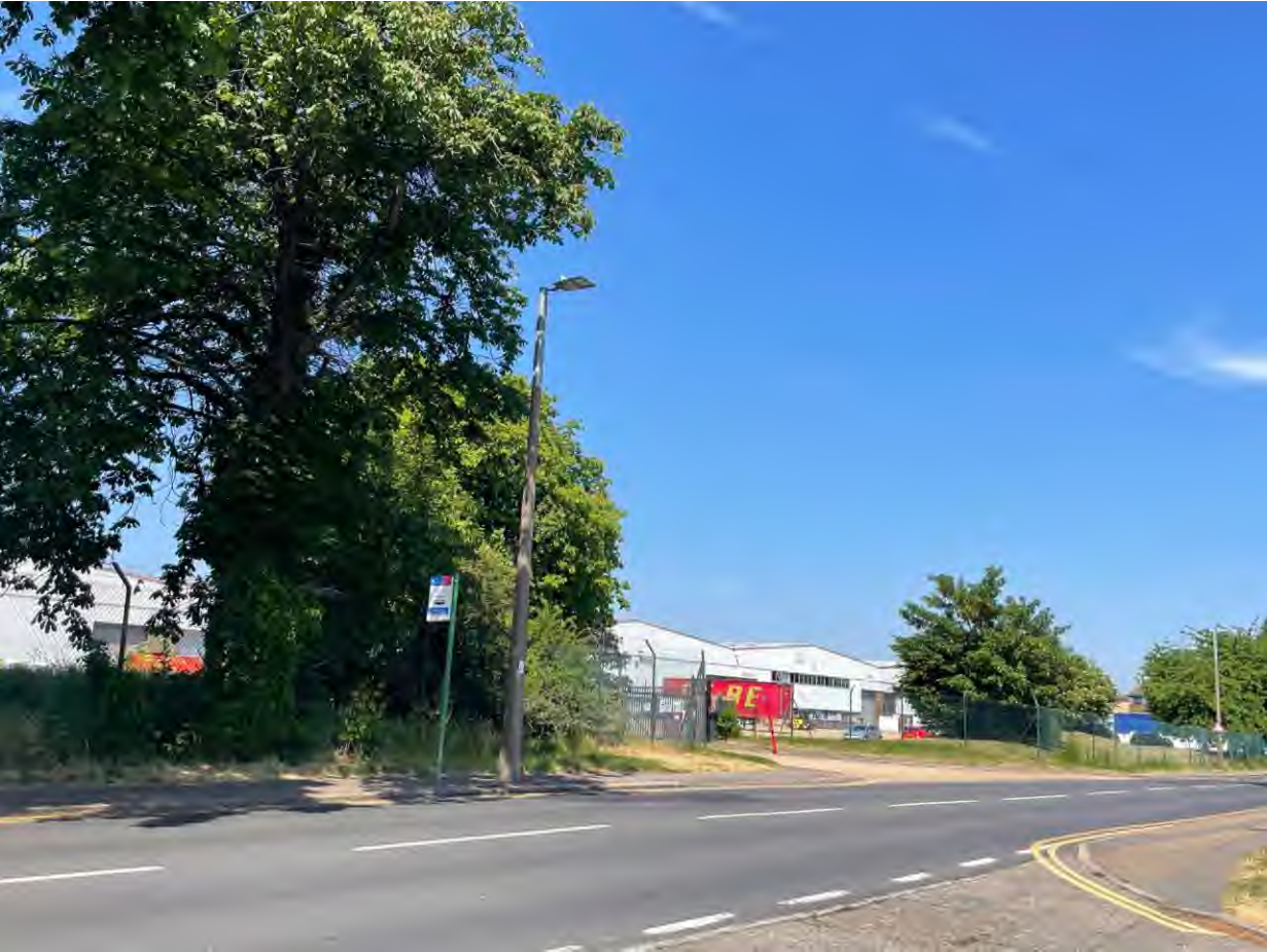
Industrial properties set well back from road