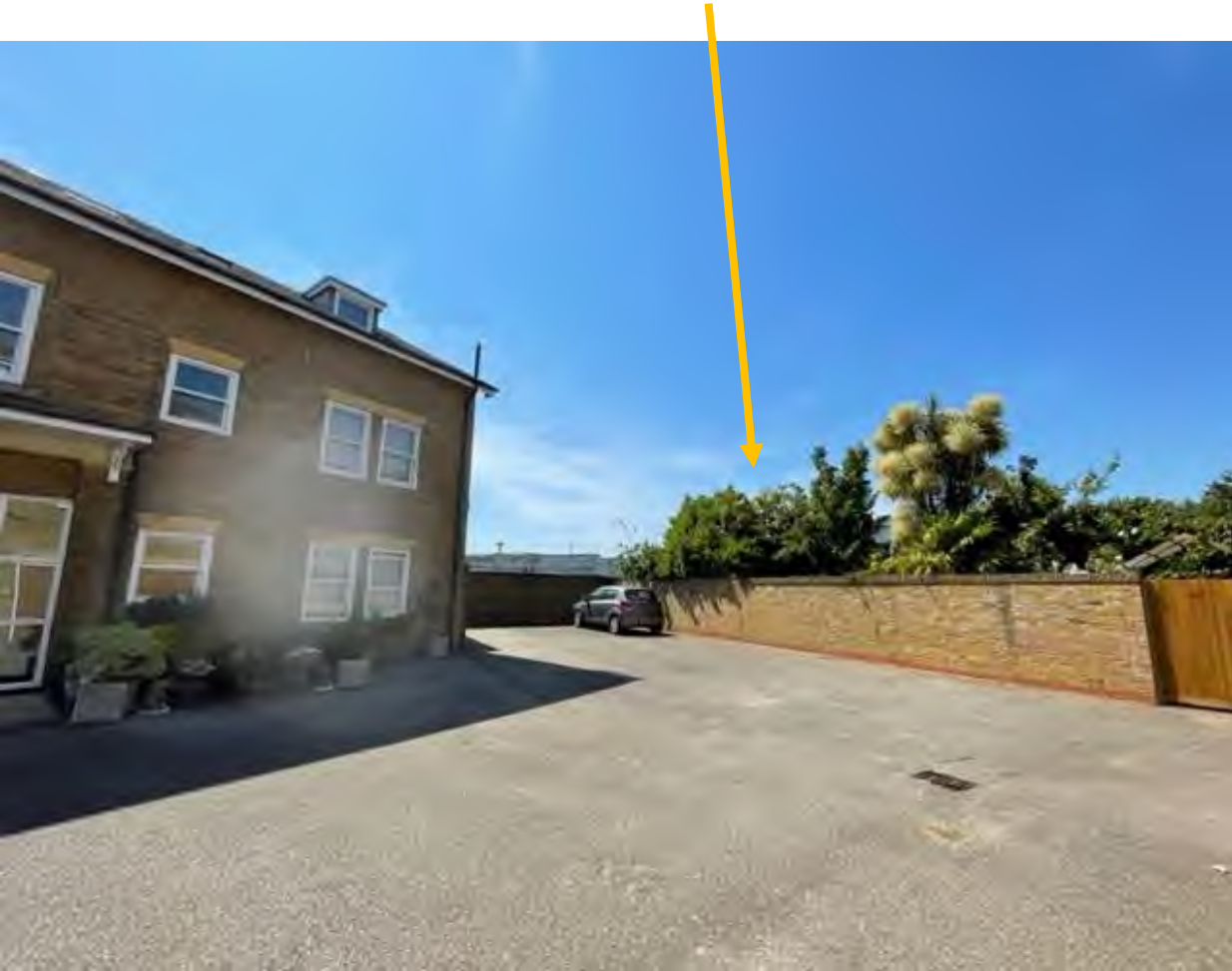
Site behind garden and high Garrison wall