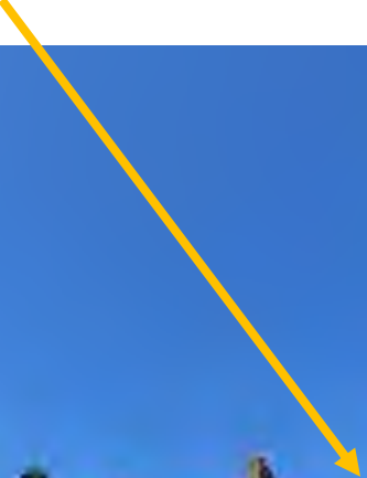
SW corner of the site